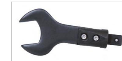
type A (optional)