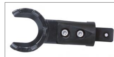
type M (optional)