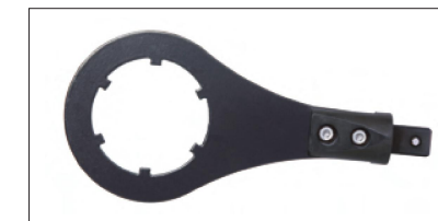
type O (optional)