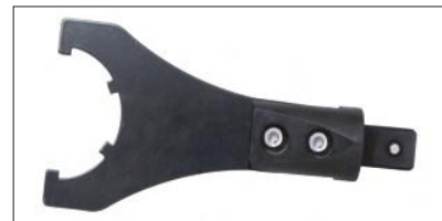
type UM (optional)